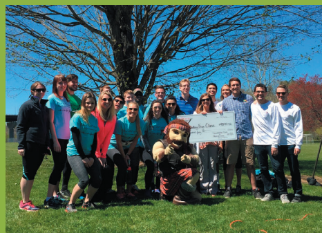
Radford University's Pre-Dental/Medical Club