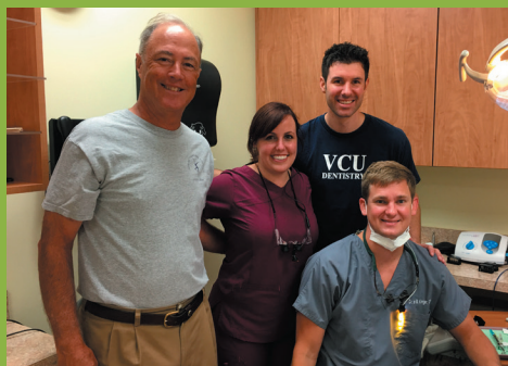
miniMOM Dental Days