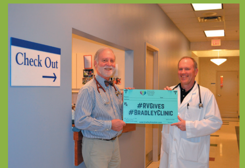
Roanoke Valley Gives 3.16.2016