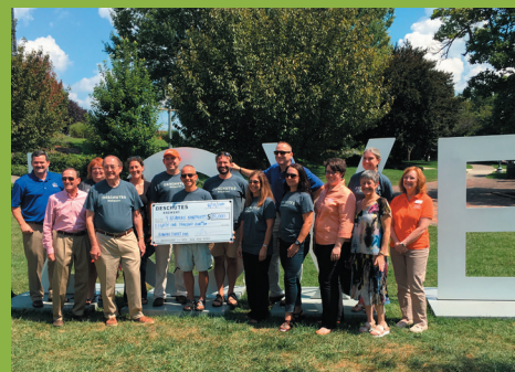
Deschutes Street Pub