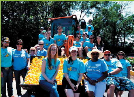
3rd Annual Roanoke River Duck Race